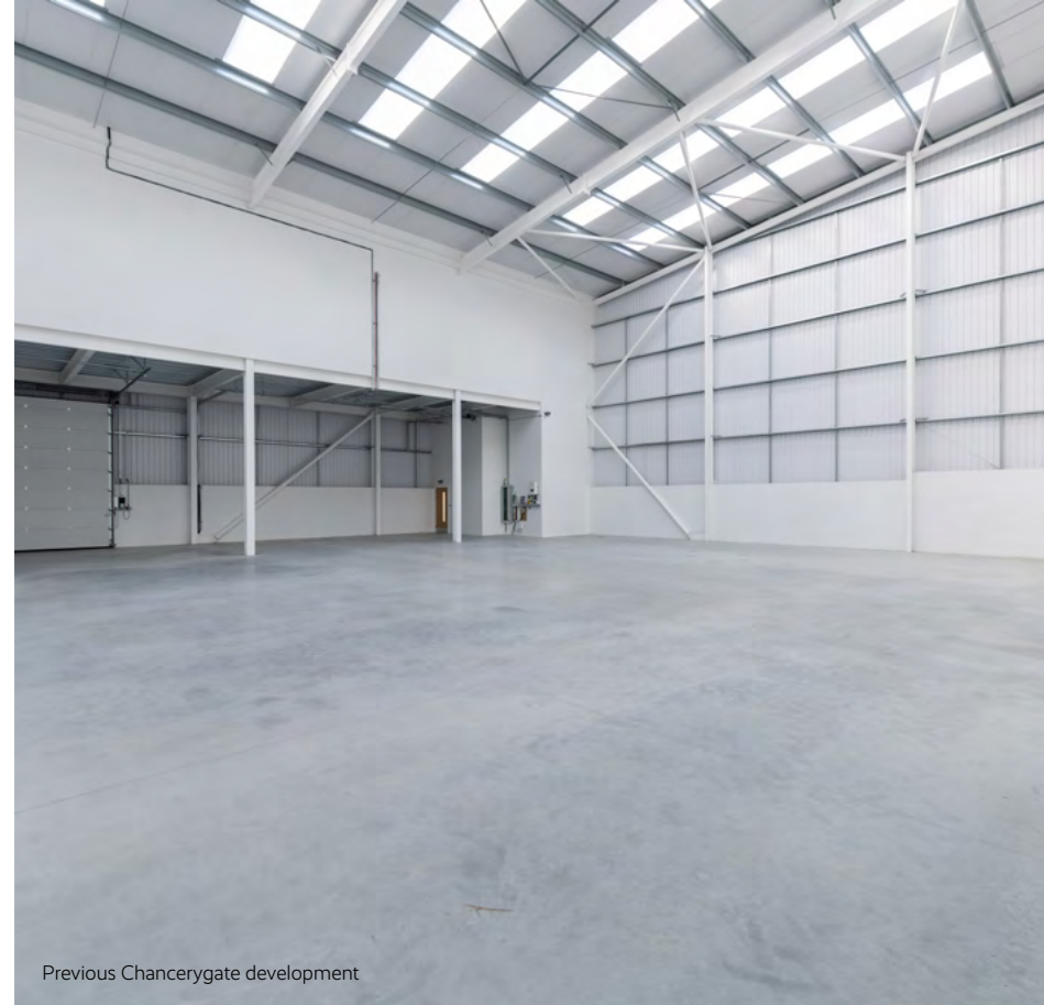
Previous Chancerygate development