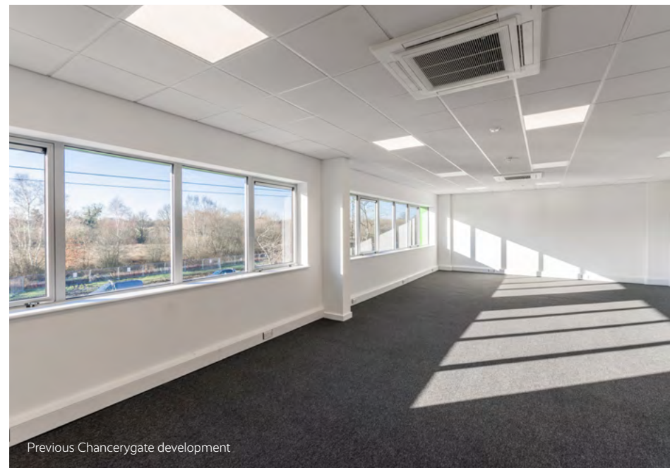
Previous Chancerygate development