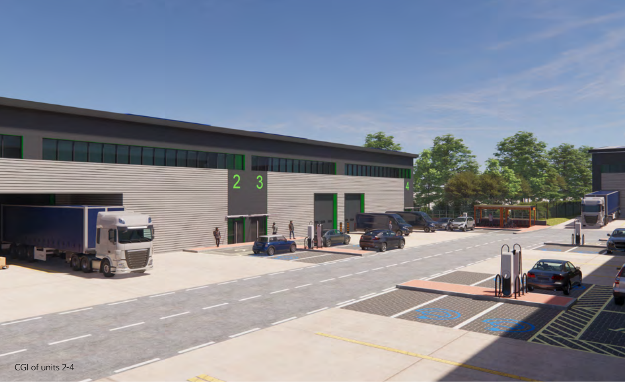
CGI of units 2-4