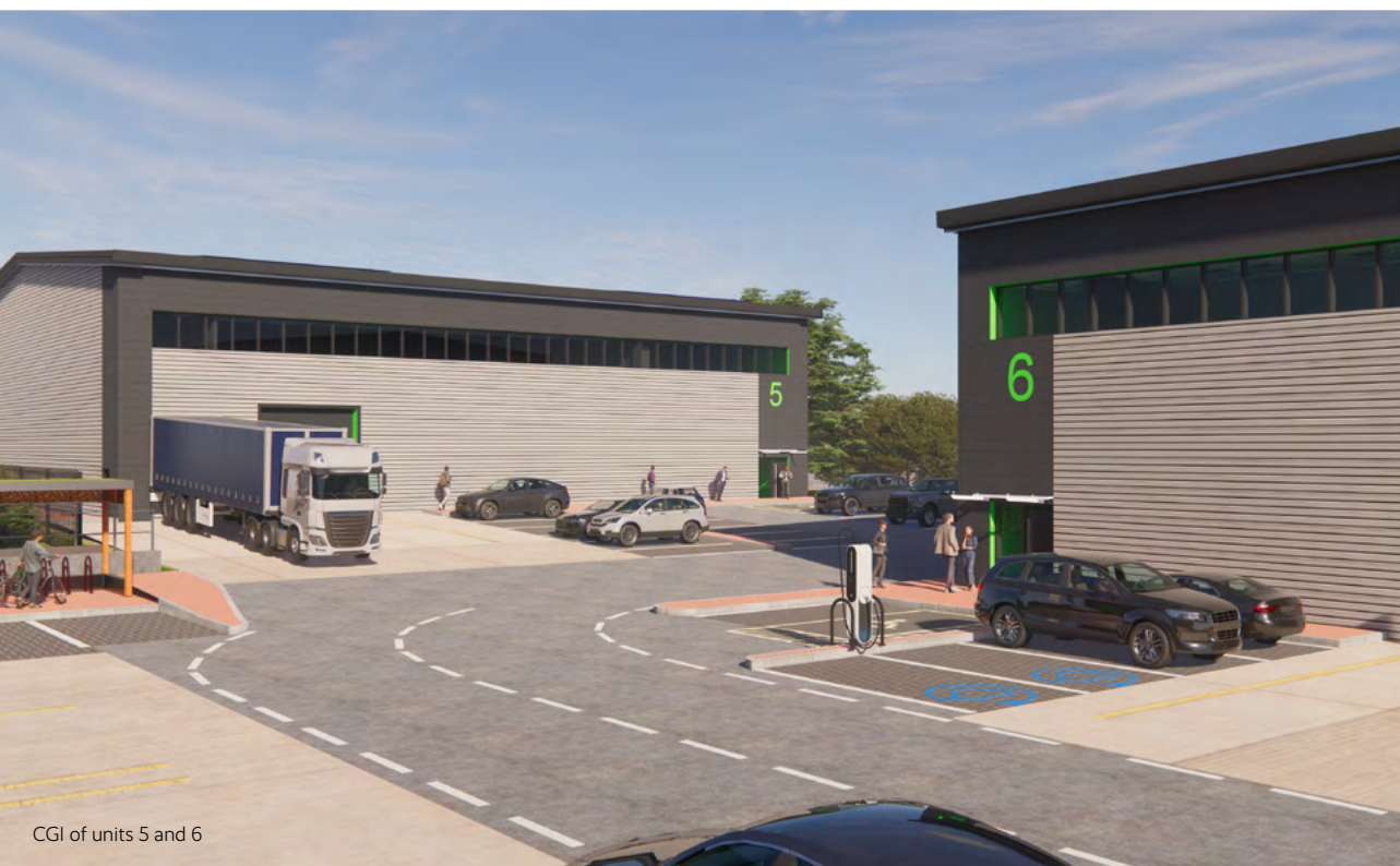
CGI of units 5 and 6